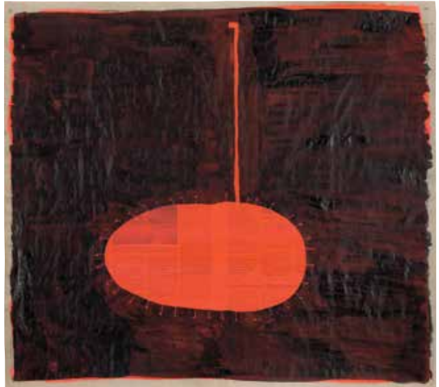
Top: Phoebe Washburn A Champ Sighting , 2012 © Phoebe Washburn, courtesy Josée Bienvenu Gallery