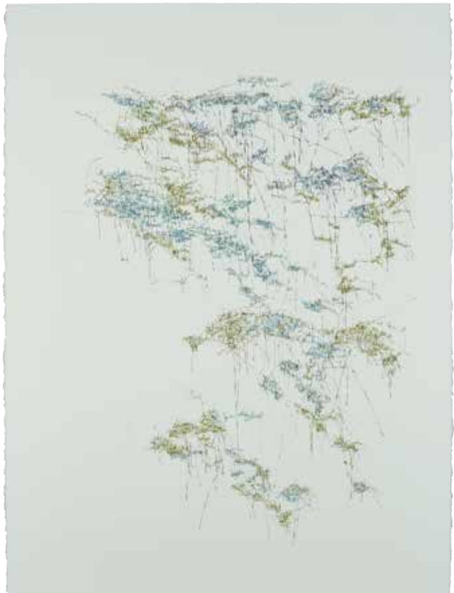
Right: Alice Attie Strolling and Wandering , 2012 © Alice Attie