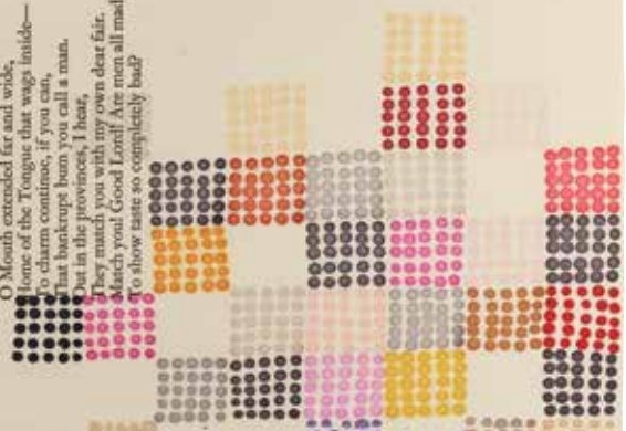
Károly Keserü Untitled (1204071), 2012 Cover: Dan Shaw-Town Untitled, 2014